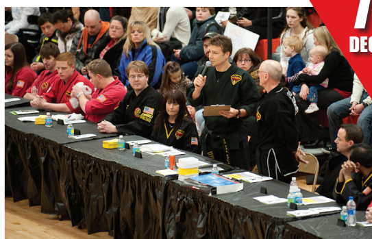
7 TH DEGREE

PROMOTED TO 7 TH DEGREE BLACK BELT JUNE 2012