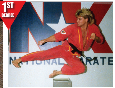
JUMP SIDE KICK 1989