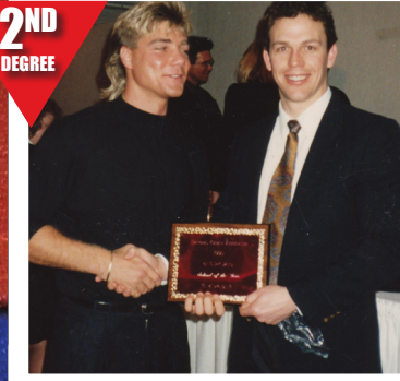
SCHOOL OF THE YEAR AWARD 1990