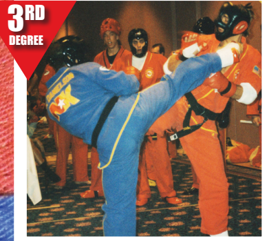
TOP COMPETITOR AWARD FOR FIGHTING 1993