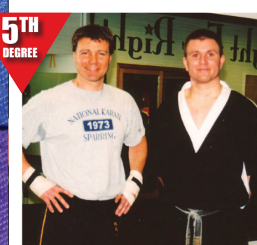
SPARRING WORKOUT W/ SUPER FIGHTS CHAMP BRIAN RUTH 2004