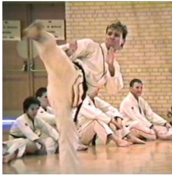
1987 TESTING FOR 1 ST DEGREE BLACK BELT