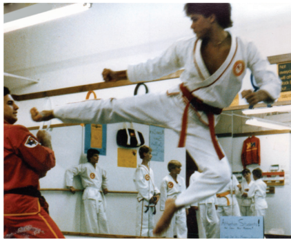
RED BELT 1984