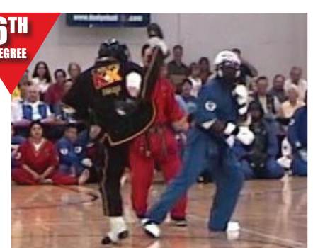
6 TH DEGREE BLACK BELT TEST 2005